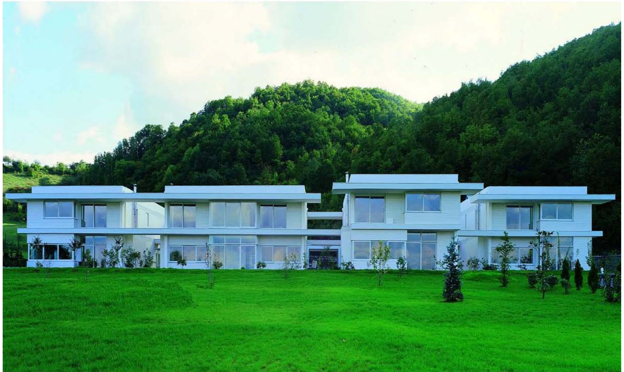
FOUR HOUSES IN KOCAELI 3256.TUR.

Programme Four brothers and their families wished to live in close proximity to each other, but rather than commission a cluster of detached houses they chose to have an apartment building with an urban character. The four separate housing units are linked on two levels by cantilevered walkways. Between the houses, and between the block and the garage structure, are open spaces intended for social gatherings. The structure is concrete with timber windows and cladding.