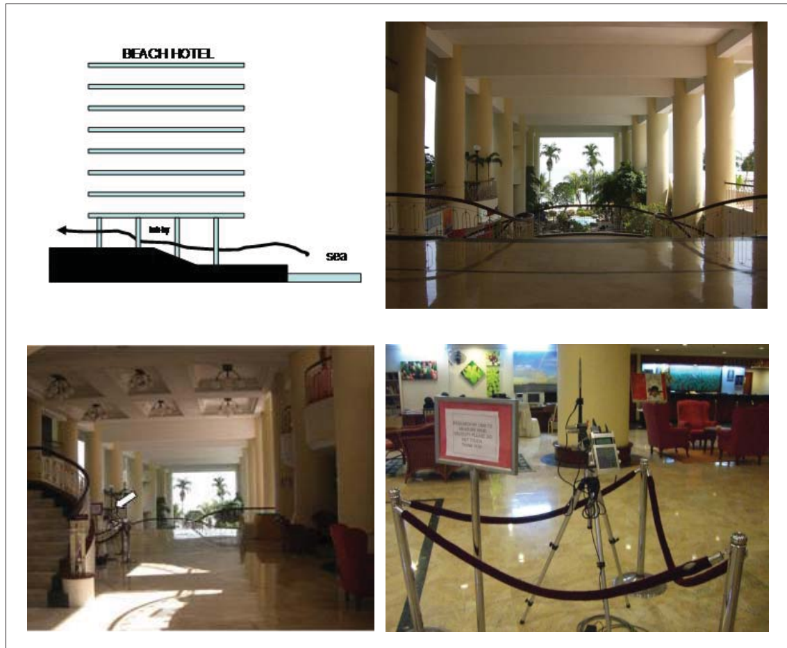
Figure 1: (Top left): Diagrammatic cross section of hotel. (Top right): Hotel lobby looking towards the sea. (Bottom left): Hotel lobby as seen from Main Entrance and location of the BABUC environmental data logger. (Bottom right): The BABUC environmental data logger measuring air temperature, air velocity and relative humidity/ (Source: Authors).

A hotel at Bukit Jambul, Penang perched up on top on a small hill was chosen to represent the test case for a hill slope with a prevailing wind condition. The arrows in the diagrammatic cross