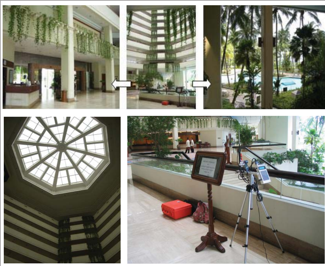
Figure 3: (Top left): The main entrance glass door and wall (Top middle): Hotel lobby and atrium (Top right): The panoramic view to the sea and Penang bridge (Bottom left): Top end of the atrium allowing for daylight. (Bottom right): The BABUC environmental data logger measuring air temperature, air velocity and relative humidity.

climatic elements, namely the air temperature, the air velocity and the relative humidity. The discussions that can be derived from these two graphs are as follows (Graph 1):