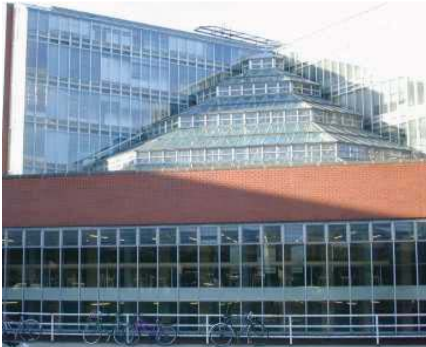
Figure 6: Built in the 1960s, a time when environmental concerns played little or no part in the design of buildings, the Cambridge University History Faculty was effectively a giant glasshouse – more than enough daylight, but too hot in summer, too cold in winter. Paradoxically the building was awarded a Gold Medal by the RIBA in 1966.