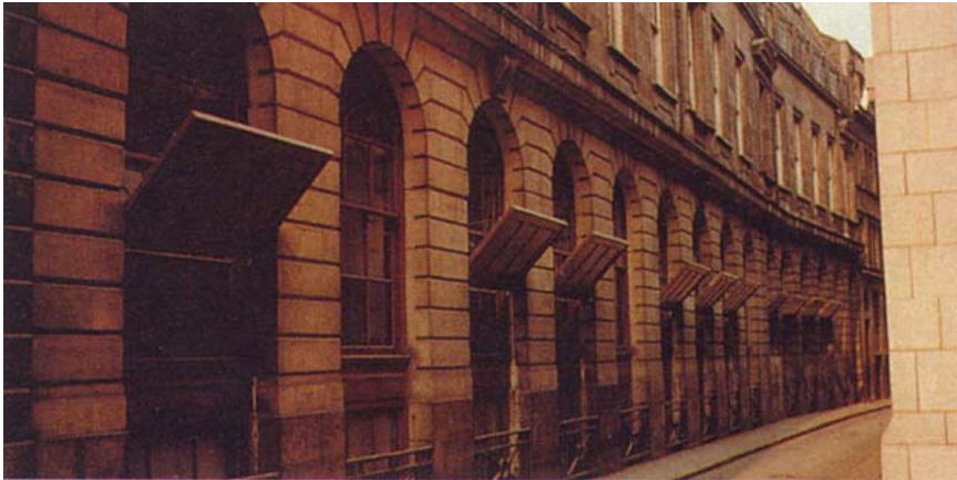
Figure 7: As London's narrow streets developed, little attention was given to making best use of natural light. An exception was this factory building in Ironmonger Lane, where early examples of light scoops were fitted to help improve working conditions inside the building.

As architects we would also do well to acknowledge the inspiring legacy left to us by the likes of Khan, Le Corbusier, and others. We should also recognise that a few contemporary architects (such as Steven Holl, and Lord Norman Foster), have taken up the reins, and continue to work within the principle that “... light inspires us and can enliven space. There are few things as delightful as the ever changing presence of natural light in a building. Natural light tells us about the weather, the time of day,