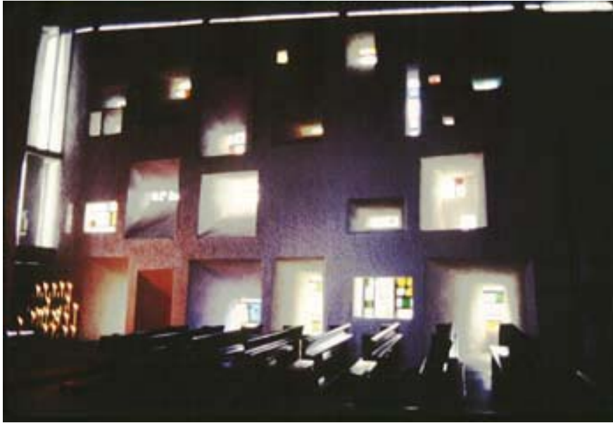
Figure 1: The interior of Le Corbusier's chapel at Ronchamp, indicating the architect's skilful use of natural lighting.

Buttiker believes that later in Kahn's career, daylight became more and more significant in his work. He developed increasingly sophisticated ways and means of manipulating light, and according to Buttiker the zenith of his achievement is shown in one particular example of his work, namely the Assembly Hall in Dhaka,