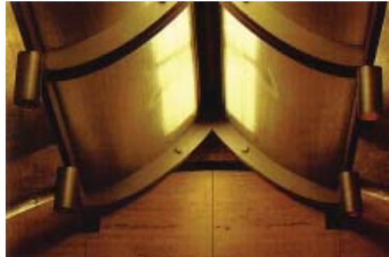
Figure 3: Daylighting of museums and galleries is not universally favoured by curators because of risk of UV damage to the exhibits. In the case of the Kimbell Art Museum, however, and in order to minimise this risk, Khan used perforated aluminium ceiling diffuser-reflectors to admit controlled levels of natural light.

Ander also draws upon the words of these two leading exponents of daylight in architecture, firstly in quoting Le Corbusier - "I use light abundantly, as you may have suspected. Light for me is the fundamental basis of architecture. I compose with light." And adding Khan's quote that "... a room is not a room without natural light. Natural light gives the time of day and the mood of the seasons to enter. The choice of a structure is synonymous with the light which gives image to that space ... a plan of a building should read like a harmony of spaces in light" (Ander, 1995:(ix),6).