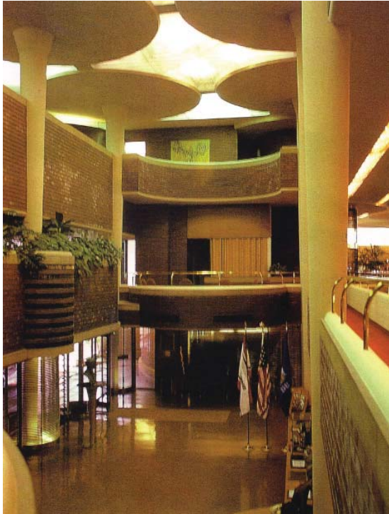
Figure 4: Johnson Wax Building, Rascine, Wisconsin, in which Wright has created a top lit interior office space at the core of the building.

area (Figure 4). Architects, like all innovators, will sometimes push boundaries beyond the knowledge and techniques available at the time, and this can be said of this project. The level of technology failed to match Wright's innovative thinking, and regrettably much of the tubing had to be replaced.