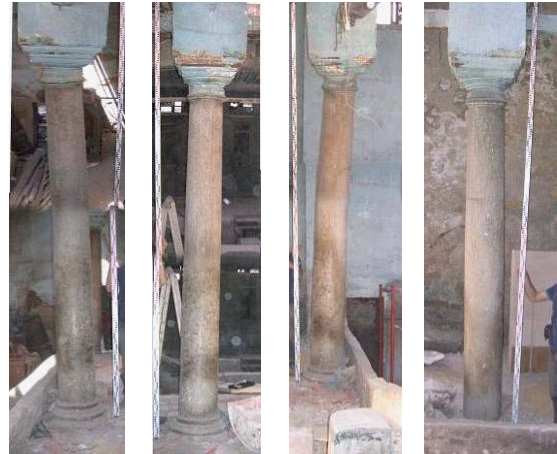
Figure 2: Hammām al-Tanbali, The Columns of the Bayt Awwal. (Source: Author).

The second apparent result from applying the Antiquities law on hammām al-Tanbali is the large number of empty plots that surrounds the western and the southern sides of the building, including the vast property that was once occupied by the traditional furnace of the hammām (mustawqid). The vacant plots are the results of implementing the legal buffer zones that are applying to the surrounding