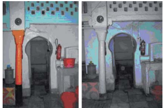
Figure 6: Columns and Walls of the Changing Room, with Color Changes.

The fabric of hammām of Souq al-Ghazl itself is not under any type of protection but its context