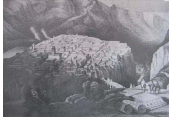
Figure 5: Rock of Constantine as Depicted in 1840.

Minister was pointing in his notion to colonial remains, which were not appreciated by some extremists, and thus were subjects of constant assaults.