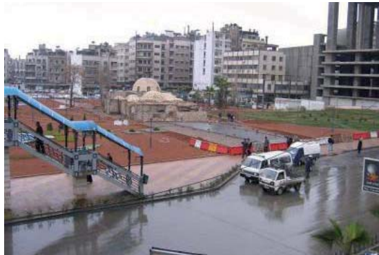
Figure 4: Hammām Qarama'ni as it Survives Today in Damascus, 2007.

If hammām Ammuna is registered as a monument, the bathing activities might not be ceased, as was the case in hammām al-Tanbali of Egypt. Also, the waqf, as an overseer of the hammām, would continue to administer the building. A buffer zone would then be identified around the building were no development would be allowed. This buffer zone might reach the extreme case of hammām Qarama'ni which has become a free standing structure in a garden in downtown Damascus, deprived from its historic urban context which was an old market that has been fairly recently demolished.