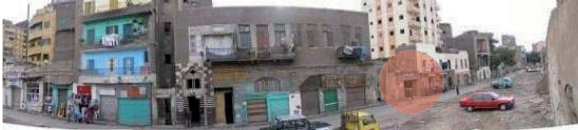
Figure 1: Hammām al-Tanbali in a Continuously Changing Urban Context.

The consequences of applying such type of protection on hammām al-Tanbali are apparent today in different aspects. Since the function of the building is not of any value, it was not necessary to preserve it, and thus, hammām al-Tanbali is now locked without any sort of legal protection for its different particular spaces. It is not in the Antiquities Authorities interest to preserve the function, but on the contrary, it would be better if the activities are ceased so that the deterioration of the historic built fabric could be controlled. Certainly this approach is a misconception that was based on the romanticism of the nineteenth century, but proved with the time that it is utterly wrong. It is now understood that the best way to preserve the building is to use it appropriately. Unfortunately, the notion did not still find its way into the Egyptian legal protection system.