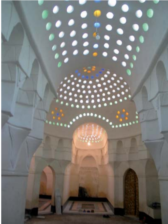
Hammām Tayruzi, Damascus, Syria.

of bathers, Ingress seems to have ignored this comment in spite of the fact that, for centuries, hammām etiquette requires women and men to remain partially clothed.