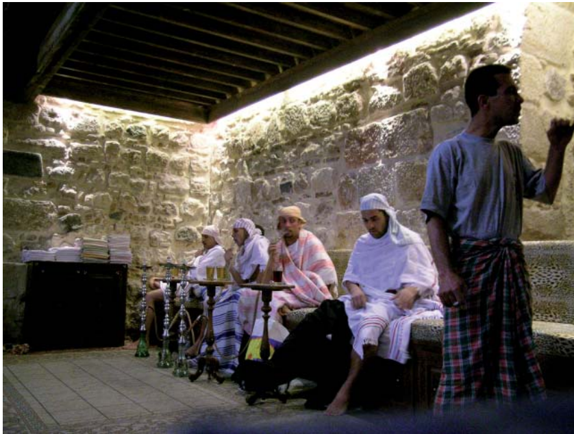
Hammām Al Malek Al Zaher, Damascus, Syria, (Source: Ahmet Igdirligil).

The papers in this issue have been organised according to three broad themes reflecting the multidisciplinary nature of the work. These themes are: social and cultural aspects, conservation and heritage protection, urban and architectural analyses, environmental evaluations and future scenarios of sustainability. The papers cover case studies in the whole area of North Africa from Morocco to Egypt as well as others in Syria and Turkey.