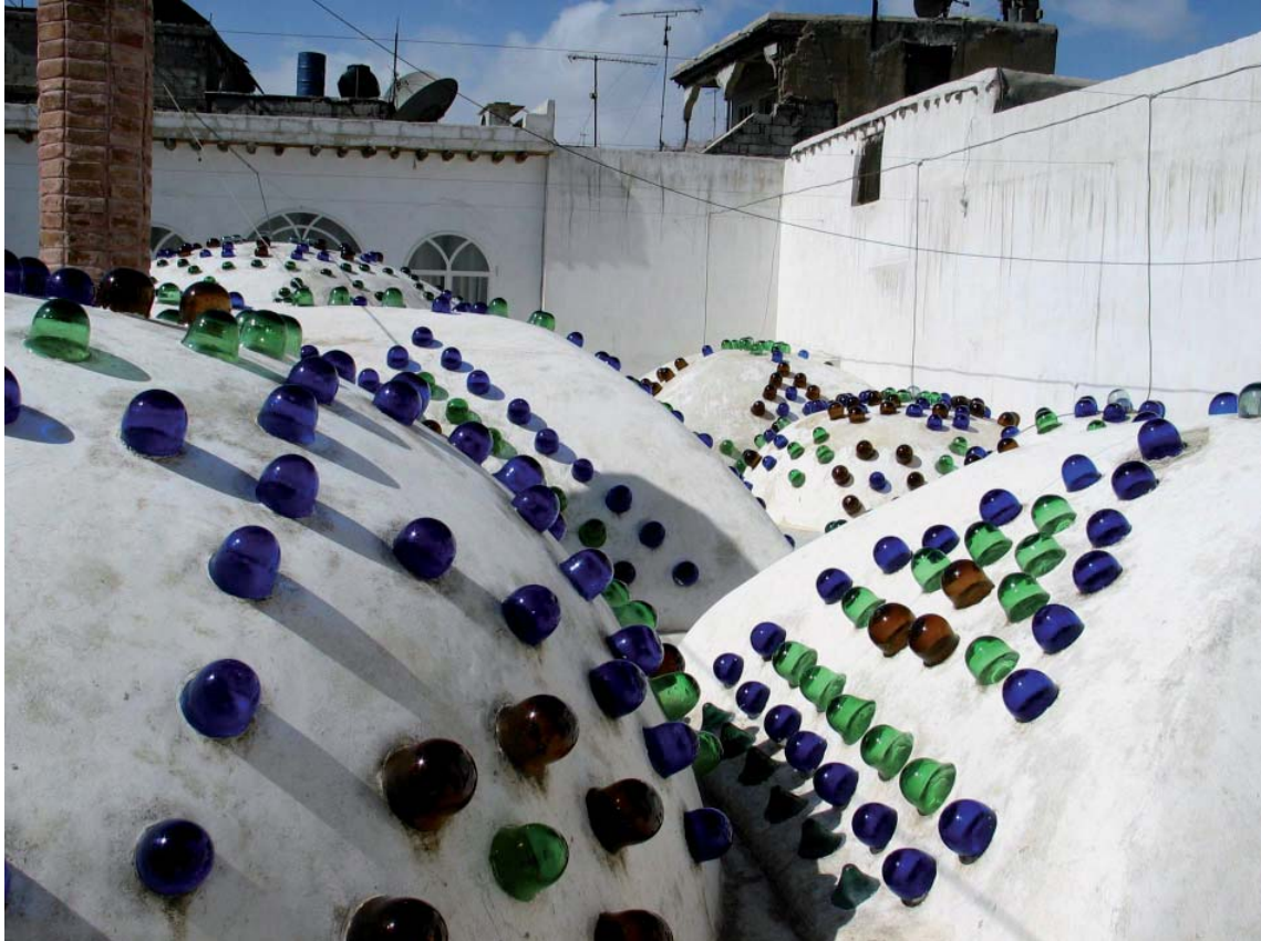
Hammām Fethi Domes, Damascus, Syria, (Source: M. Sibley).

Orehounig. The passive environmental strategies are explained in Bouillot's paper. Data on indoor environmental (thermal) conditions and outdoor microclimatic conditions in the immediate vicinity of five traditional hammams located in Egypt, Turkey, Morocco, Syria, and Algeria was collected by Mahdavi and Orehounig who present an objective assessment of the actual