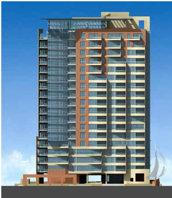
Figure 17: Treatments of Northern Façade, Directly Influenced by Climatic Factors.

façade has more glazed surface than the west since it is commendable to allow early sunrays of the morning to flood the bedroom spaces and unlike the west, the east sun makes short morning visits any way. The south side has conservative openings on the few bedroom spaces situated in this direction; otherwise, standard small openings are for service areas. The final outcome is that the four sides have different façade treatments directly influenced by climatic considerations, which is something so rare in tower design, particularly in the Gulf (Fig 17).