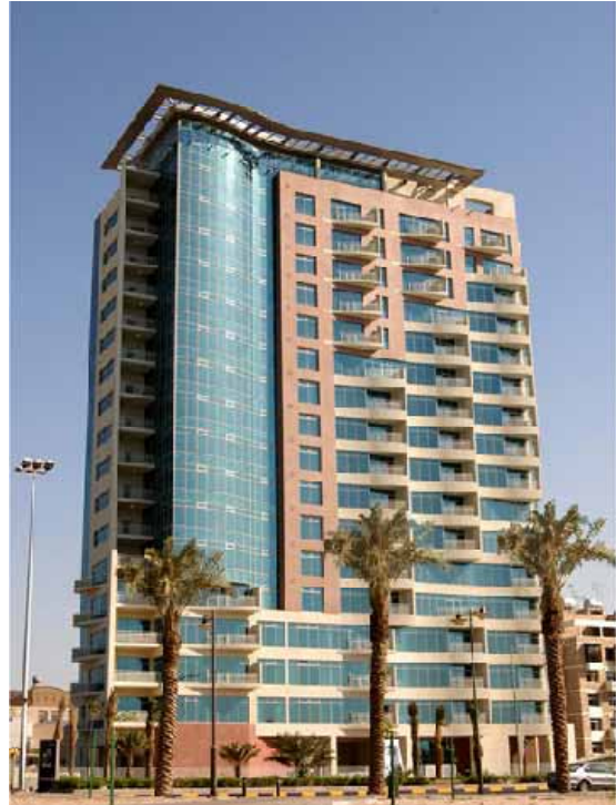
Figure 15: A Conscious Attempt at Introducing Environmentally Responsive Articulations.

With this arrangement, they had to go for a high-rise instead of a low-rise building achieving the same floor-area-ratio. Although this meant 20% increase in construction cost and 12% longer in construction time, nevertheless, there was less dependency on mechanical means to cool the space during hot months. On reviewing the sides of the tower, it becomes clear that the North façade has the highest concentration of glazed surface. The west façade, being the worst in hot climate, is almost solid. The east