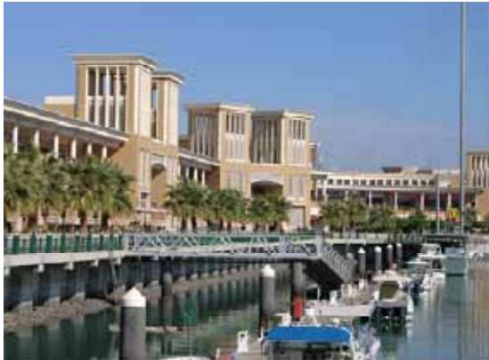
Figure 1: Suq Sharq, Kuwait.

despite architectural excellence in some cases! (Fig 1). The paper will show the schism between what ought to be and what actually is. Ideal theoretical positions in architecture schools do not match real practice. Through examples that are widely acknowledged in their hometowns, the paper identifies architecture trends in the Arab world that can suggest future positive trends and perhaps bridge the gap between theory and practice.