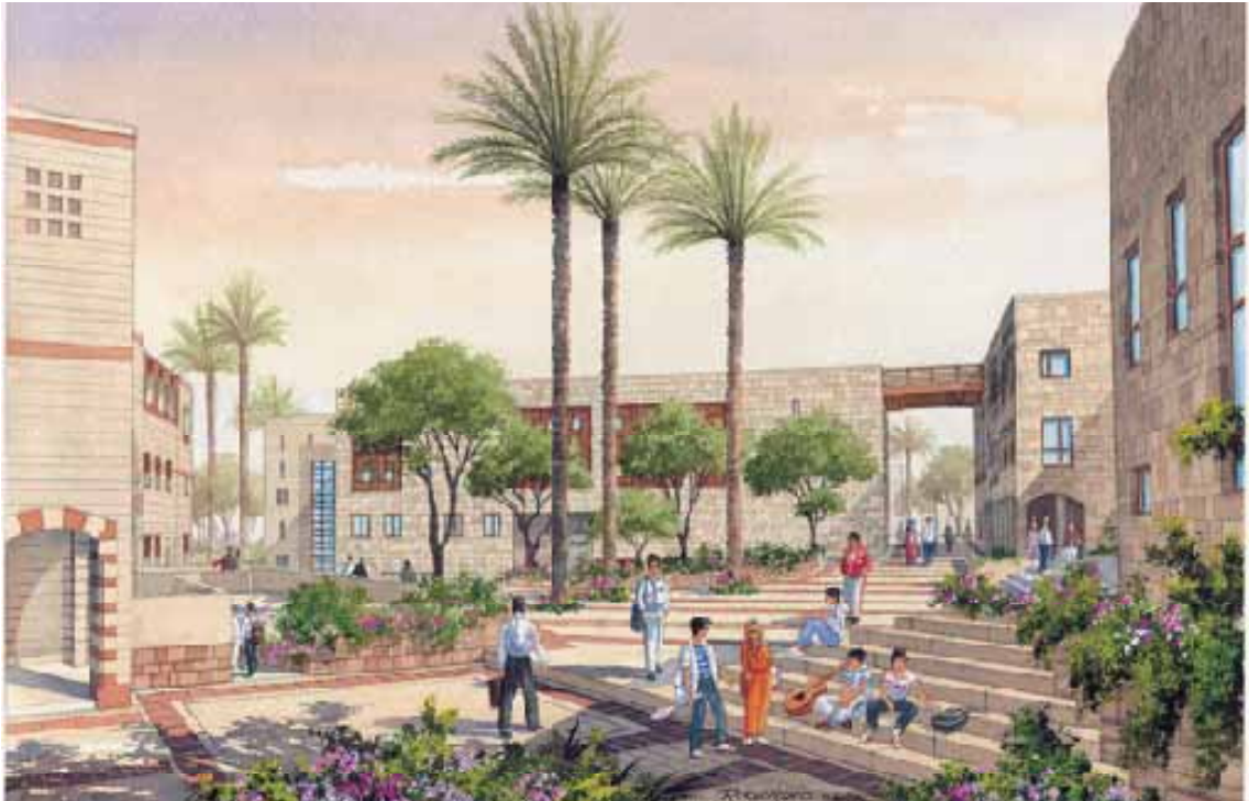
Figure 18: A Park in Front of the Main Entry Portal of the New AUC Campus.

Abdel Halim Ibrahim, the "Prime architect" together with Sasaki, had the intention to revive the university tradition of interacting with local community. He envisioned the space in front of the main entry portal to become a park that provides the potential for community interaction with AUC members. The park is a space full of activities that can be of interest to the public (Fig 18).