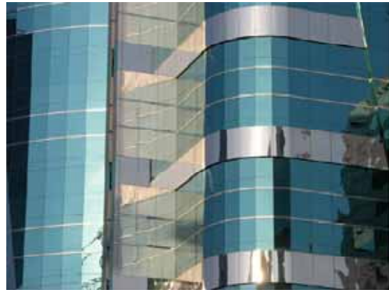
Figure 2: A Typical Isolated Event: A High Rise in Abu-Dhabi.

Contrary to the wishes of intellectuals, what proves to be successfully vibrating with the society at large does not exist in their debates. "Return to tradition" (1) was an exciting new motif during the eighties in the Arab intellectual world. These arguments about visually abstracting history in a modern way still exist today surprisingly among new generations of intellectuals, and even editors of magazines. They cannot break the code of stagnation. It became a sort of an official position for academicians in front of their students.