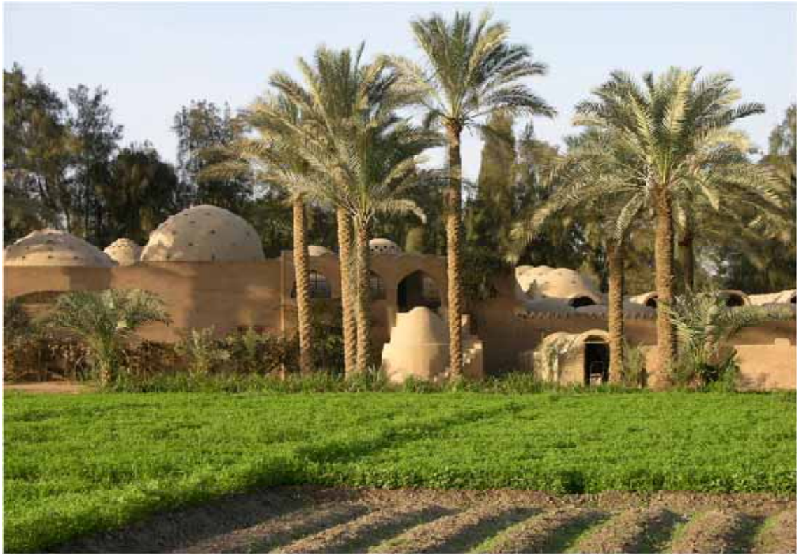
Figure 7: Harania Village, Designed and Developed by Ramses Wisa Wasef.

less efficient when it comes to environmental measures. By linking the rural setting to their source of income, farmers trained by Wisa Wasef realized that social aspiration must include their indigenous built environment. Their carpet design became world famous and their village became a landmark in Egypt proudly