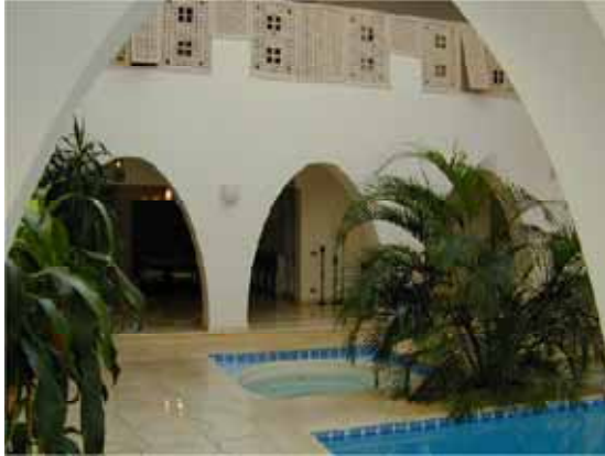
Figure 9: The Courtyard of Alayli Villa Acting as a Socio-Spatial and Climatic Modifier.