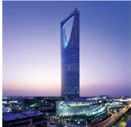
Figure 3: Al-Mamlakah Tower in Riyadh, An Example of A High Tech Imaging.

or western classicism with a bit of novelty is part of their cultural landscape. They travel abroad and see it fashionable, they identify with it. On possessing it they understand its impact on their surrounding neighbors. It gives them prestige and a window with a view on the advanced world.