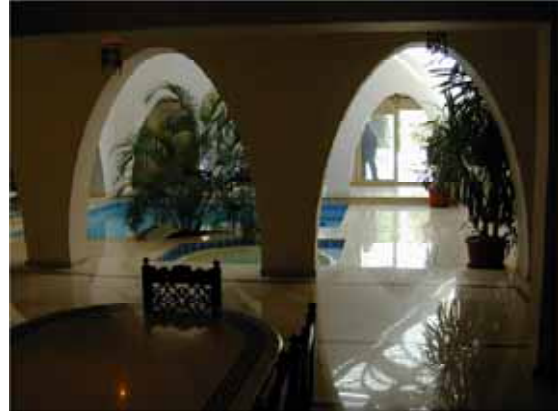
Figure 10: The Transparency of the Courtyard of Alayli Villa Marking the Modern Lifestyle of the Family.