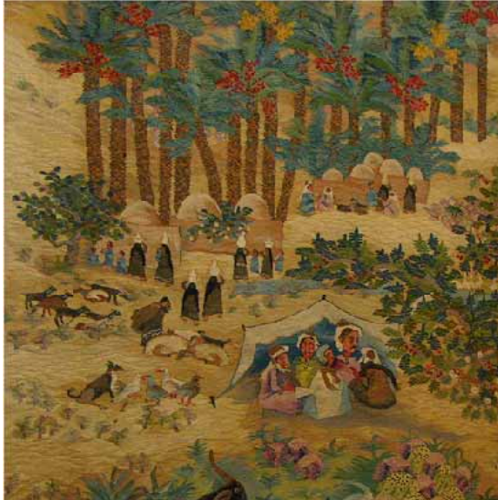
Figure 8: Carpet, Designed and Manufactured by Farmers at Harania Village.