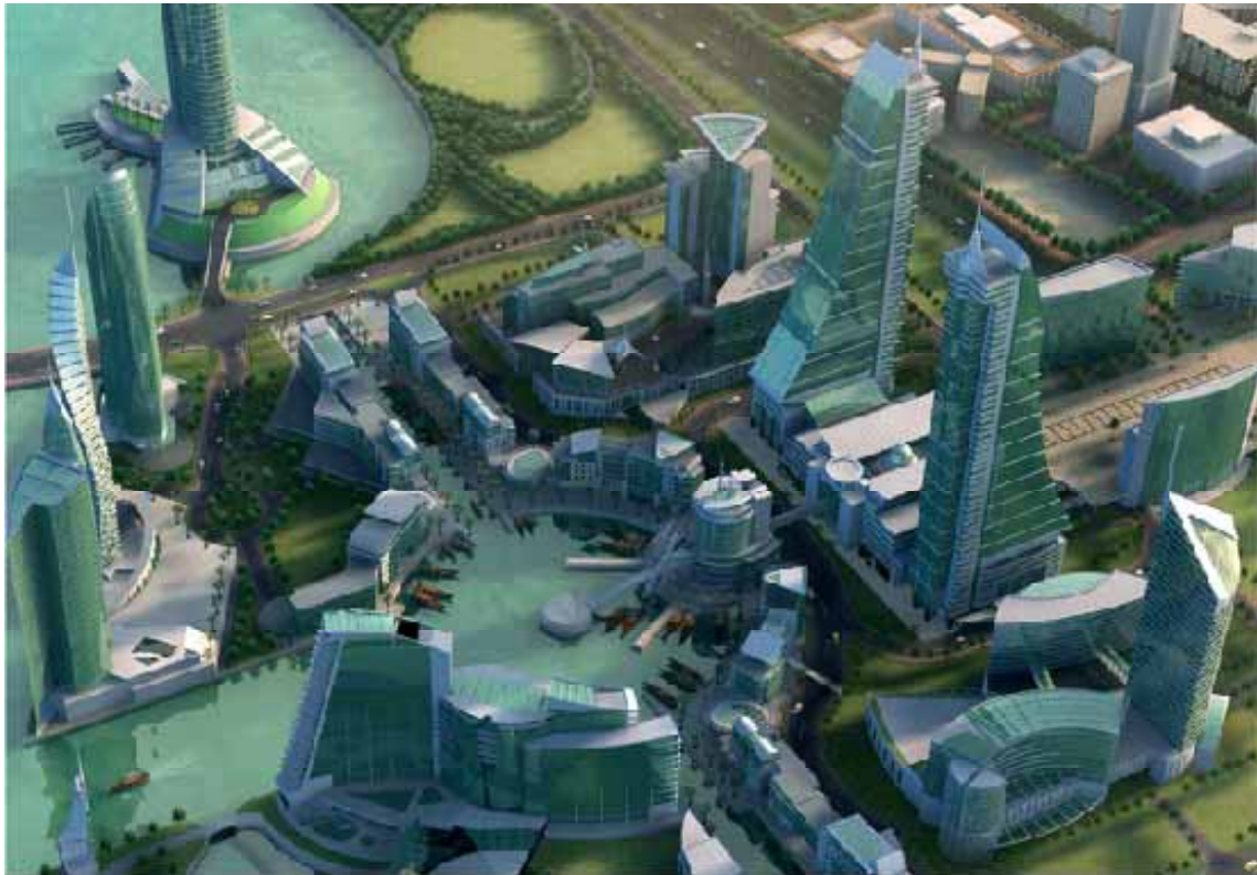
Figure 4: Bahrain Financial Harbor, Designed by Ahmed Janahi.

find shopping boulevards along the waterfront, marina, water taxis, restaurants, coffee shops and opera house. All those activities infiltrate within the business oriented buildings such as, a stock exchange center, insurance companies, financial enterprises, hotel, upscale apartments, and media center.