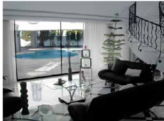
Figure 13: The Living Space Opened to the Courtyard and the Swimming Pool.