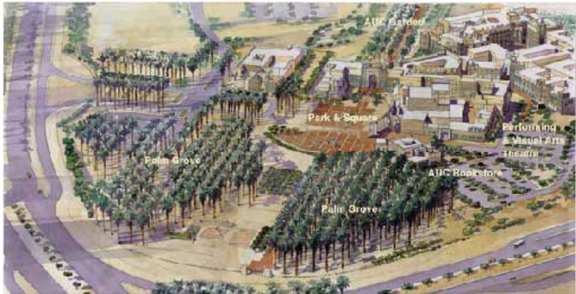
Figure 19: Three Hundred and Sixty Palm Trees Simulate the Classical Era of Old Cairo.

Friendliness to the public and the environment becomes the most significant statement a foreign university can offer to the surrounding milieu; hopefully it can influence other public institutions of similar nature in the vicinity to follow suit.