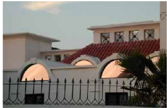
Figure 14: Interior and Exterior Views Showing Clerestory Windows Accommodated in the Roof Vault Structures to Allow for Indirect Diffused Light.