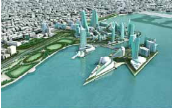
Figure 5: Bahrain Financial Harbor Designed by Ahmed Janahi.

The Bahrain project did not only create large water frontage but equally large garden area along its side. This means that the public along with the professional community will view the landmark ensemble through endless vistas of the garden. People strolling through the garden or along the seafront using various facilities, will be amused by the changing panoramas; for buildings vary in height, mass and orientation. The project becomes their city icon, their image in front of the rest of Gulf States, their pride to the outside world (Fig 5).