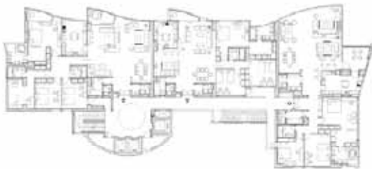
Figure 16: Orientation of Main Spaces Toward the North.

Option One discarded such common alternative by arranging the units on a single loaded corridor with the units facing north; while the corridor, stairs and elevators facing south. This situation is plausible since all the living and reception areas and most of the master bedrooms face north (Fig 16).