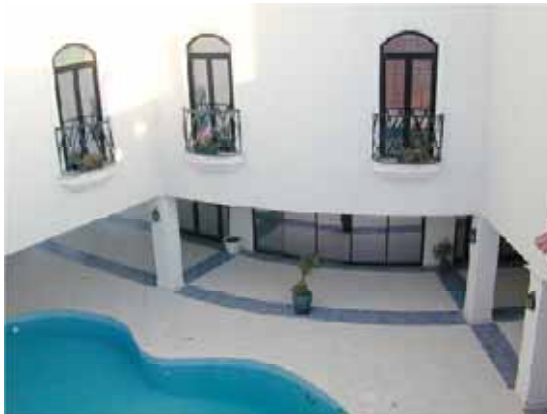
Figure 12: A Courtyard with a Central Pool at Al-Nammary Villa, Designed by Mohamed Abulnour.

More of this approach is evident in Al-Nammary villa. Natural soft light fills most of the essential spaces of the villa by adopting another