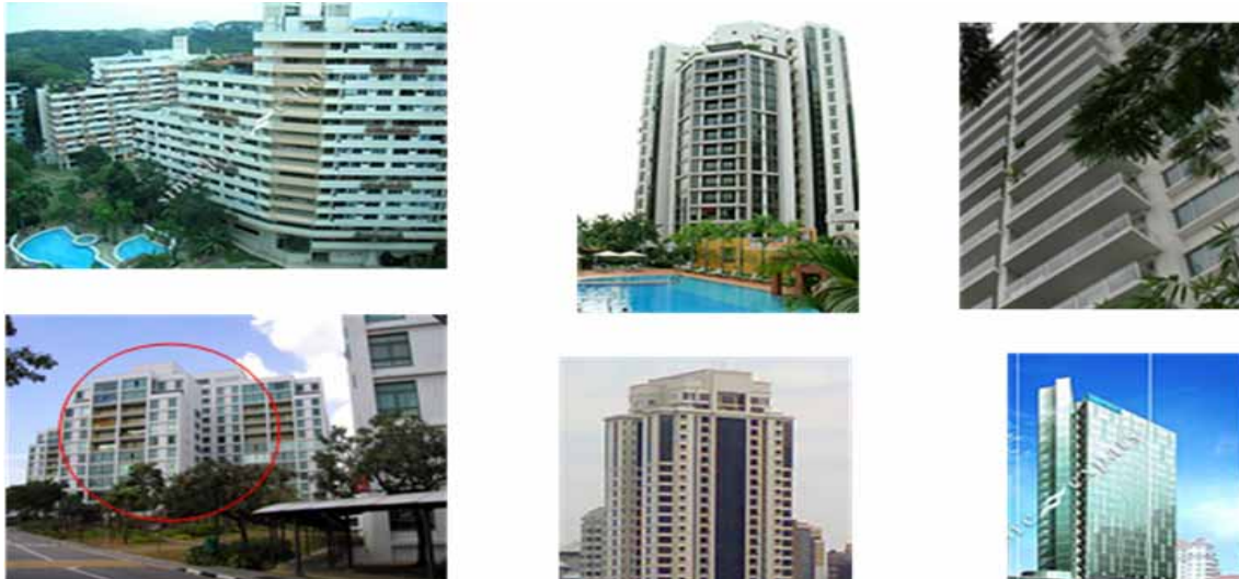
Figure 1: Condominiums of Singapore

this reinforces the escalation of living standards of Singapore citizens. This dynamism in the demand and supply as well as the occupant type (local or foreigner) seems to be having a high correlation with the design of the prototype as well. Figure 1 shows a range of condominiums ordered according to the years of completion and it is suggestive of the change that has happened during years in the design thinking of a condominium.