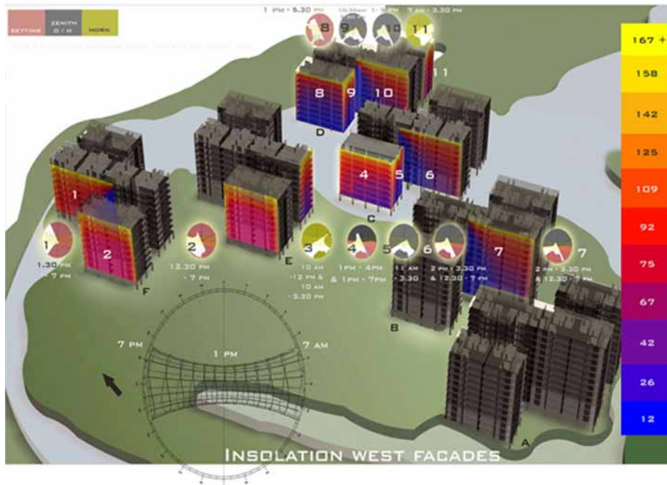
Figure 2: Insolation Study to Identify the Total Incident Radiation in \text{W/m}^2

The diffused radiation is predominant in the case of tropics in approximately a ratio of 3:1 with the direct radiation. Hence, combating the high angle sky reflected components, the low angle ground components and the reflected radiations from the opposite and adjacent reflective surfaces is a major task in the case of