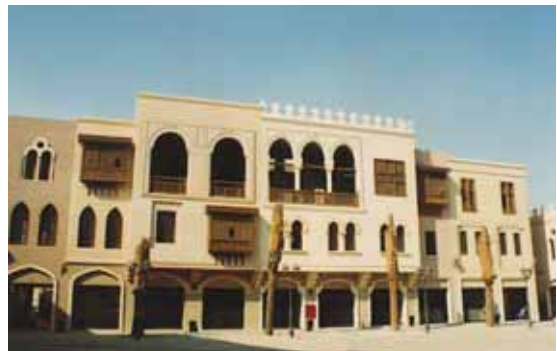
Figure 3: Khan Al Azizia, Cairo-Alexandria Desert Road. Example of Cloning Islamic Architecture!