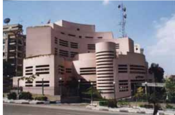
Figure 5: Integrated Care Society, Heliopolis, Cairo. Example of Surface Treatment Architecture "A Basic Design Exercise on Building Form and Facades," By Magd Masara.