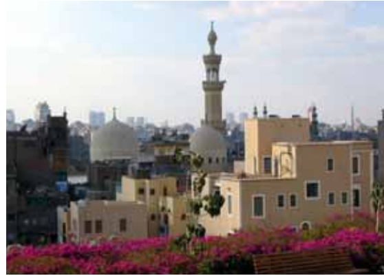
A. Figure 12: Upgraded Houses around Al Azhar Park Project.

Cairo has lost over the years (Salama, 2002-a) (Figures 12 A & B).