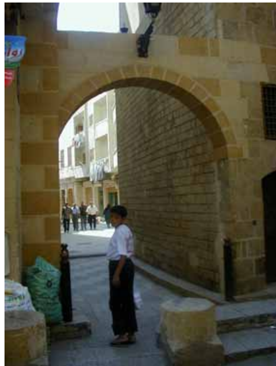
B. Figure 11-B: The Entrance of Al Darb Al Asfar After Restoration.