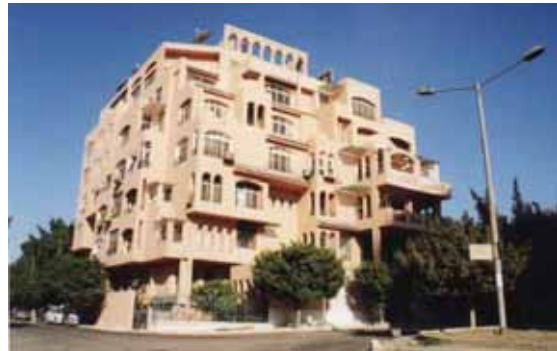
Figure 2: Apartment Building, Al Mokattam District, Cairo. Example of Islamic Revivalism by Ashraf Salah Abo Seif.