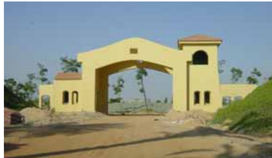
Figure 8: A Typical Example of an Entrance of a Gated Community on the Northern and Eastern Suburbs of Cairo,