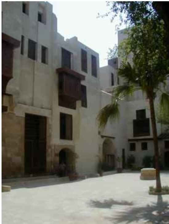
A. Figure 11-A: The Back Yard of Al Suhaymi House After Restoration.

Like other areas of heritage and cultural value, the area around the Al Suhaymi house in Old Cairo was neglected. Documentation and preservation processes started in 1994, funded by a grant from the Arab Association for Social Development. Three distinguished houses in the alley have been refurbished: the Al Suhaymi house (1648), the Mostafa Gaafar house (1713) and the Al Khorazati house, a living example of 19 th -century residential architecture. As restoration proceeded in the three houses, the