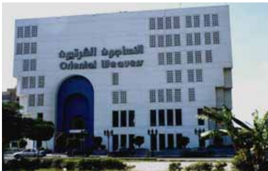
Figure 1: Oriental Weavers Headquarters, Heliopolis, Cairo. Example of Islamic Revivalism by Farouk Al Gohary

and allowed themselves to copy and paste from the past. In Khan Al Azizia project, the developer and the architect wanted to create, in the desert, an image similar to that of old Cairo (Salama, 1999). The architect copied some features of old Cairo such as the mashrabiya and the narrow openings. An attempt was made to add and create a hybrid in some other features. However, the overall appearance is not convincing (Figure 3).