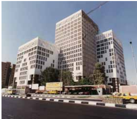
Figure 4: The Headquarters of the Ministry of Finance and Tax Department. Example of Surface Treatment Architecture "A Basic Design Exercise on Building Form and Facades," By Farouk Al Gohary.

Another trend that can be identified based on current practices is "Surface Treatment" which is basically based on avoiding the use of any reference whether historic or contemporary, local or western. This trend can be named basic design exercises in building facades. In this respect, one can argue that this attitude is based only on the creative impulses and intrinsic feelings of the architect without giving any attention to the extrinsic influences exemplified by historic, cultural, and environmental concerns. This is due to the belief among clients and architects that buildings with distinctive visual appearance can attract public attention (Figures 4 & 5).