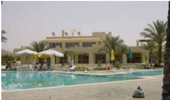
Figure 7: A Typical Example of a Clubhouse within a Gated Community on the Northern and Eastern Suburbs of Cairo.

In essence—if seen as a reaction to need, gated communities are delivering what they