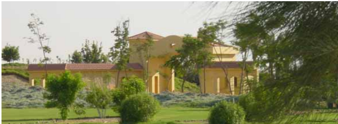
Figure 9: A Typical Example of an Entrance of a Gated Community on the Northern and Eastern Suburbs of Cairo, Manifesting the Tension between Exclusionary Aspirations Rooted in Fear and Protection of Privilege and the Values of Civic Responsibility.

tensions and paradoxes are the result. Blakely and Snyder (1997) argue, "Gates and fences around residential neighborhoods represent more than simple physical barriers. Gated communities manifest a number of tensions: between exclusionary aspirations rooted in fear and protection of privilege and the values of civic responsibility; between the trend toward privatization of public services and the ideals of the public good and general welfare... Blakely and Snyder (1997)." Other paradoxes can be envisaged such as integration within the gated communities and segregation from the larger community and that engagement at the gated community level reduces the need for civic engagement outside. It remains to be seen what impact gated communities in Egypt would have on the structure of Egyptian society and on the structure and content of the cities when more and more families and groups of individuals collectively wall themselves off from society in private developments.