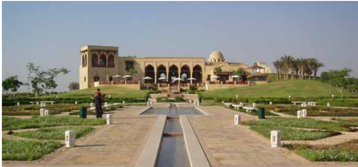
B. Figure 12: Al Azhar Park; A new Lung for Cairo's Urban Core